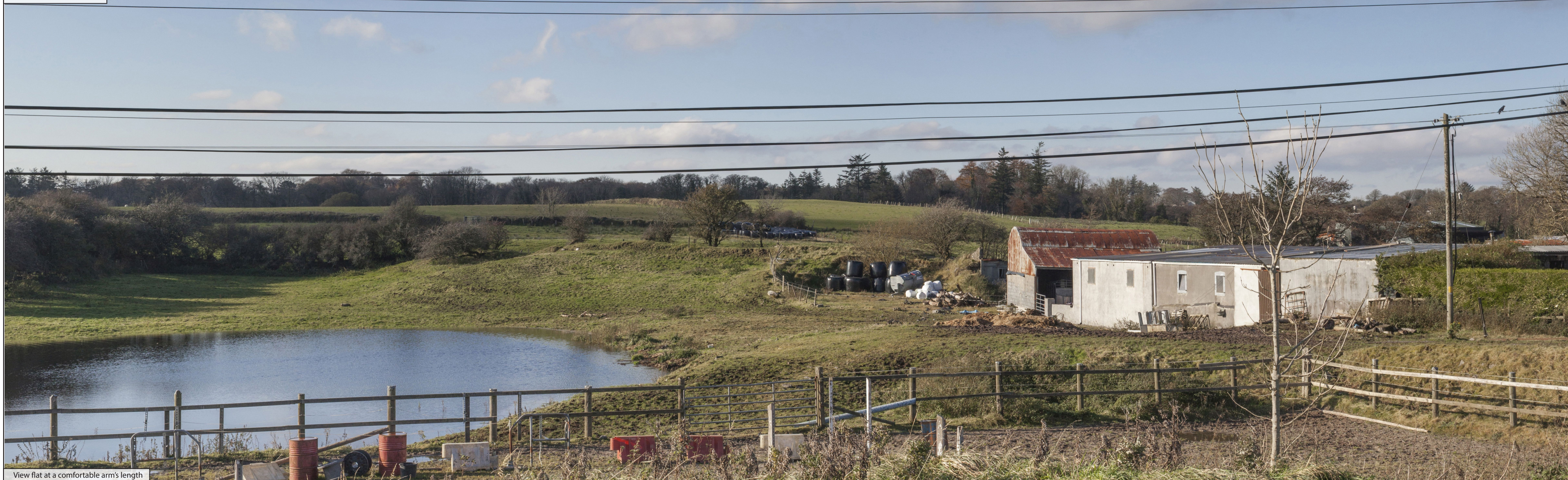
View flat at a comfortable arm's length

This planar projection panorama has been captured, prepared and presented in accordance with the guidance set out in the Scottish Natural Heritage 2017 guidance 'Visual Representation of Wind Farms'.